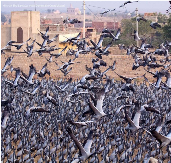
Khichan Bird Sanctuary (aka Bambawali Crane village)