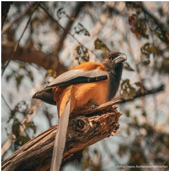
Rufous Treepie, Ranthambore National Park