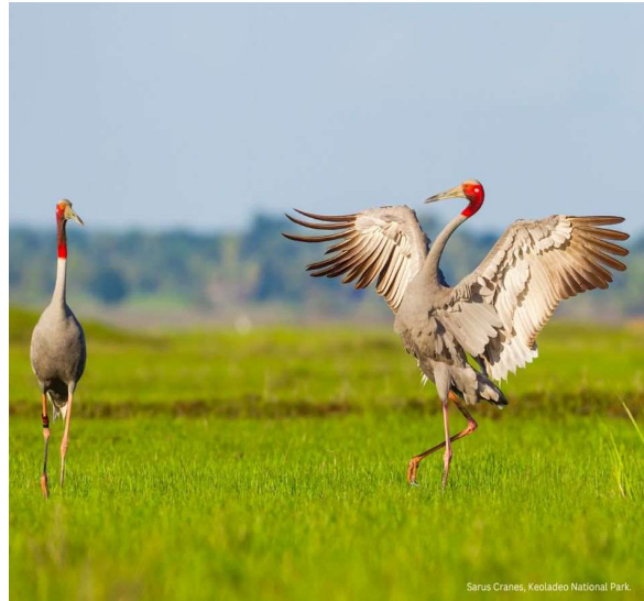
Sarus Cranes, Keoladeo National Park